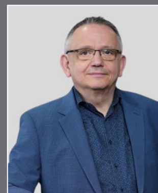
Christoph Weishaar Pilz GmbH & Co. KG

The guideline serves for the risk assessment of hydrogen installations. It is intended to describe a method for assessing risks and determining the necessary risk reduction measures and is based on the principles of functional safety.