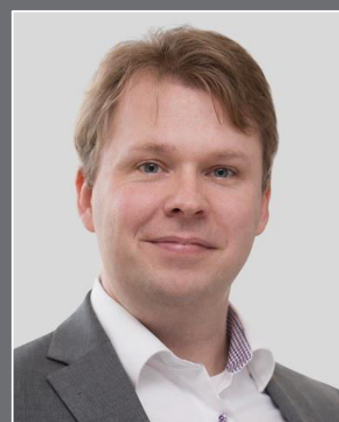
Dr. Timo Burggraf Varta AG

This presentation introduces an innovative approach to solving complex safety engineering challenges—such as the retroactive separation of safety and non-safety software in legacy systems—using AI-assisted systems engineering. A central orchestrator acts as a digital project manager, decomposing complex tasks into verifiable sub-steps and providing specialized AI agents with tailored work products to prevent cognitive overload and hallucinations. By integrating external validation tools via the Model Context Protocol (MCP) and automatically generating evidence-driven artifacts (rationale), the system creates a transparent and traceable development chain. The AI serves in a primary assistance role by visualizing architectural decisions, thereby enabling targeted "Human Gates" for expert review and decision-making. This process ensures that human expertise is empowered by transparent data models while the AI significantly enhances the efficiency of producing standards-compliant safety artifacts.