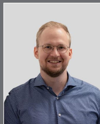
Stefan Braun Wertefest GmbH

This paper presents the application of System-Theoretic Process Analysis (STPA) as a complementary method within a real-world use case: a collaborative mobile robot (AGV) operating in a logistics warehouse, assisting workers by autonomously transporting heavy loads and interacting closely with humans. The analysis focuses on identifying hazardous scenarios arising from human-robot interaction, control structure deficiencies, and inadequate process models, particularly in cooperative operation modes.